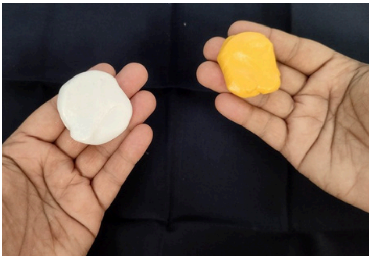
Fig 2: The two parts taken on a non gloved hand to ensure complete polymerization.