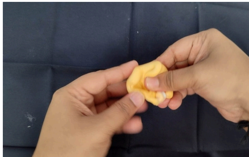
Fig 3: The two parts being mixed thoroughly with the hand to ensure complete polymerization.

issue because of the purification and very accurate measuring of the components along with the addition of palladium, which absorbs the gases. Silanation of the filler is also done to increase the bond strength between the filler and the polymer. It actually works as cross linker.