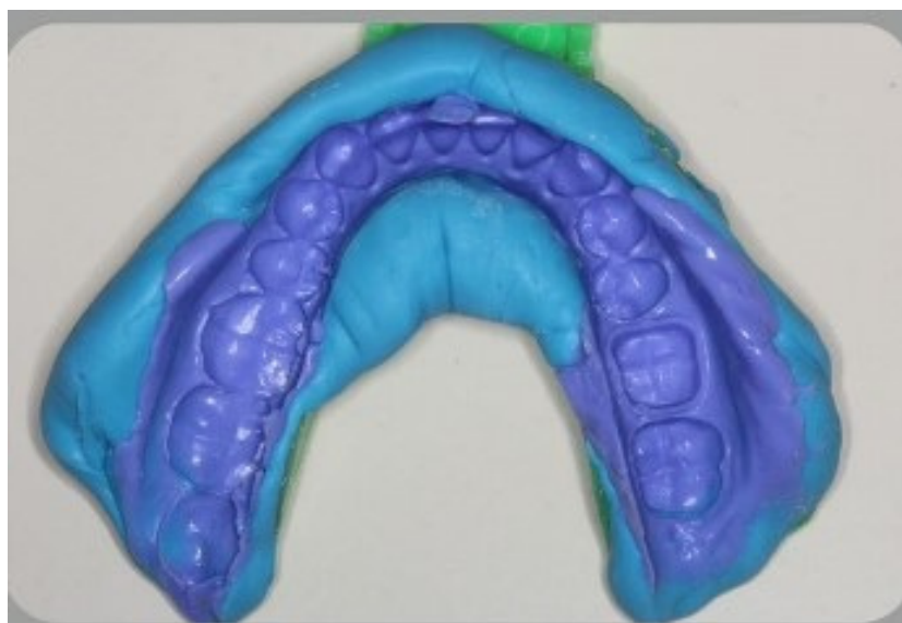
Fig 7: A lower impression completed.

Impression with Ad-Sil Acura Hard Set putty Blue and Light Body / Wash Purple