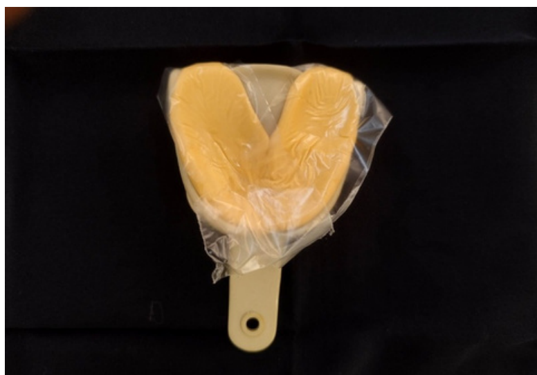
Fig 5: The putty loaded on a tray with a separator to make the putty impression. The base and catalyst are of different colors in the following pics because of the soft vs the medium set of the materials.

effectively mix and the two parts and then gives a setting time of about 4 to 5 minutes. This amount of time is generally accepted as sufficient for almost all kinds of dental impressions. Some materials add a retarder (a tetracyclic vinyl molecule) to delay the final setting time. But this has not become popular. A plain refrigeration of the material effectively delays the setting time.