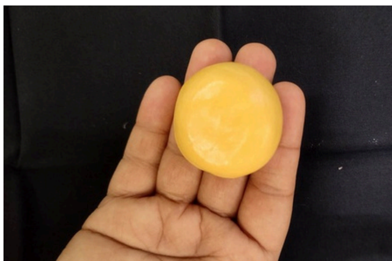
Fig 4: The completely mixed material without any part left alone during the mixing process.

Current day addition silicones have a working time of two minutes to