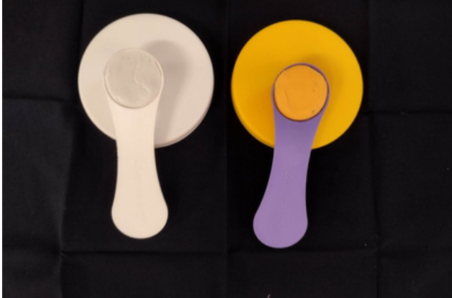
Fig 1: The two scoops of base and putty dispensed on the two spoons for mixing.

The addition silicone, “polyvinyl siloxane”, the impression material was introduced in the dental world around the 1980’s and have become the go to material for various applications in removable and fixed prosthodontics and implant dentistry. The material comes in the form of two pastes – one base and one catalyst which is thoroughly mixed to dispense a uniform mix which sets in a few minutes. The two parts can be hand spatulated, but the auto mix systems have become the norm today. This material has a very high level of patient as well as dental acceptance.